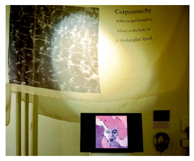
Figure 1: Corpoanarchy: A (Trans)lational Tale, Raumstation, Zurich, 2018, detail. Figure 2: Corpoanarchy: The Politics of Radical Refusal, Helmhaus, Zurich, 2019, detail.