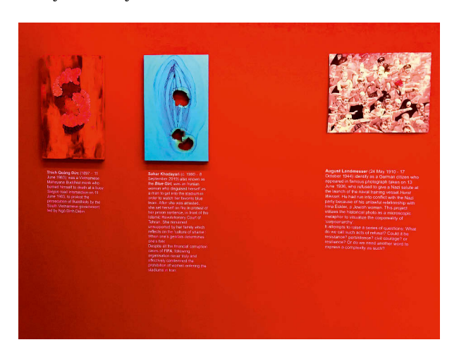
Figure 8: Contemporary examples of corpoanarchy: Kamran Behrouz, Helmhaus, Zurich, 2019, detail of the installation politics of Radical refusal.

This brings me back to the first line of this paper. Can we consider the notion of refusal, or better, of 'micropolitics of remaining still', as a form of political protest? Or in other words, how is it possible to utilize the corporeal act of refusal as a form of occupying space or even a radical form of protest? (See fig. 8)<sup>13</sup>