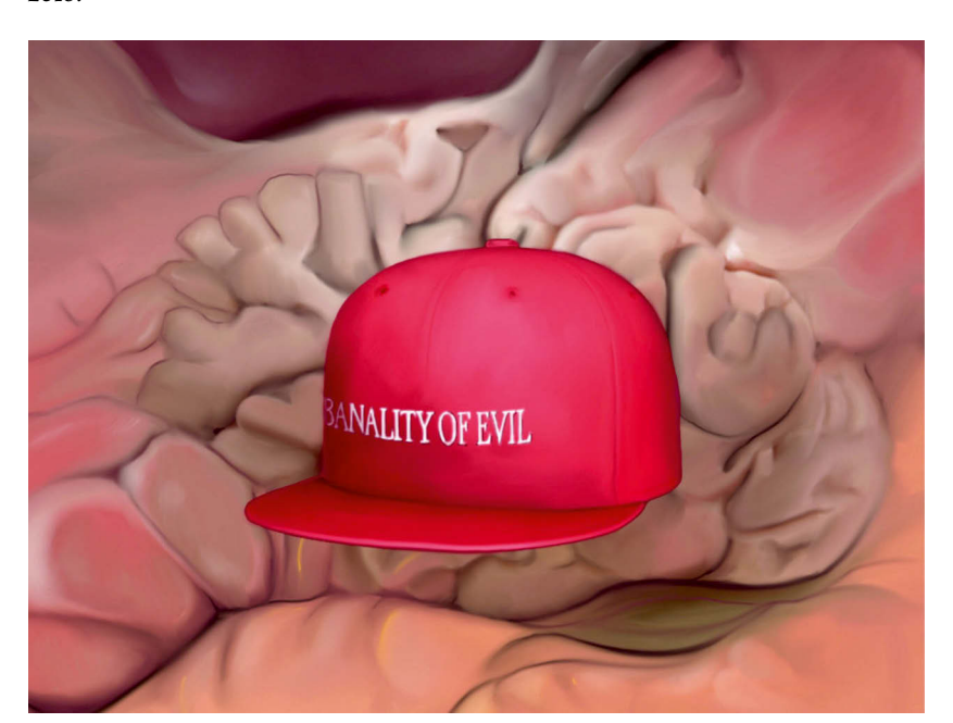
Figure 6: Video still of the animation 'Phenomenology of the Red Virus', Kamran Behrouz, 2018.

animation is projected on sheer fabric next to the death bed of Mahtab. This work analyzes the performance of the red virus and creates a bridge between the workings of populist movements and the notion of the "banality of evil" introduced by Hannah Arendt (1978: 148).