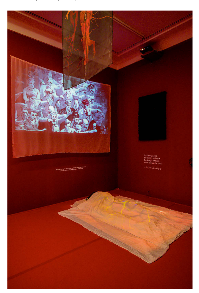
Figure 5: Corpoanarchy: The Politics of Radical Refusal, Helmhaus, Zurich, 2019, detail.

Mahtab's case<sup>6</sup>, which led me directly to Sima Shakhsari's work and their crucial essay Killing me softly with your rights (2014). The story of Mahtab outlines an unspeakable death, which Shakhsari analyzes in depth, and sadly, this story is not