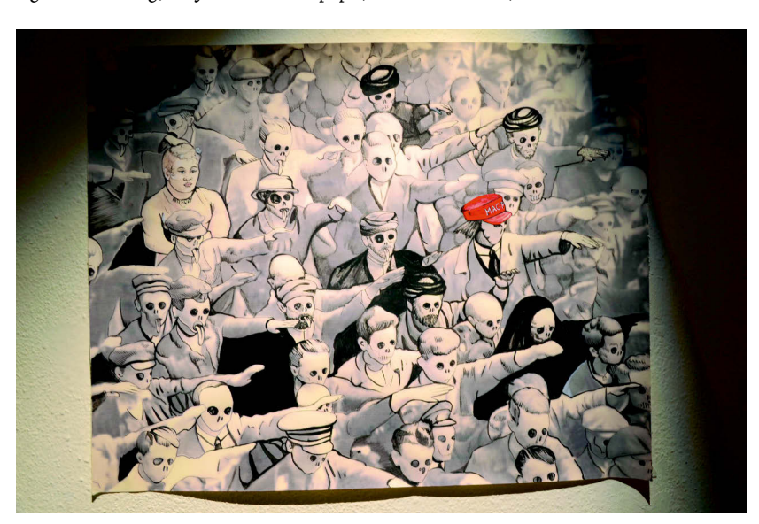
Figure 7: Painting, Acrylic and ink on paper, Kamran Behrouz, 2018.

But the virus, you know, is not something new, you know that, we thought we've been vaccinated, we never did, we never really been cured. Now once again a shiny new red virus, dismembering our memory. A very simple and banal monster. Arendt calls it the 'banality of evil': something like the inability to think, to giving in your thoughts to those mad men. Haraway calls it 'thoughtlessness', I kind of like it... My grandma on the other hand used to say 'evil will repeat itself without compassion, will repeat itself ruthlessly and thoughtlessly till it destroys itself'... (sigh) you know evil can't reflect and that's the T. So, I step back to rethink everything again: am I a virus? Or am I an antibody?"<sup>11</sup>