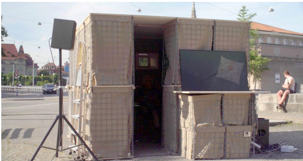
Image 4. Act 2. Gauche Caviar at Mirkan Deniz installation, Bern, 2021

Two mythical (digital) mermaids sing and narrate a story. They lure the audience (co-performers) to face the past and present structural racism and to dis-engage from species-supremacy that the site has been offered.