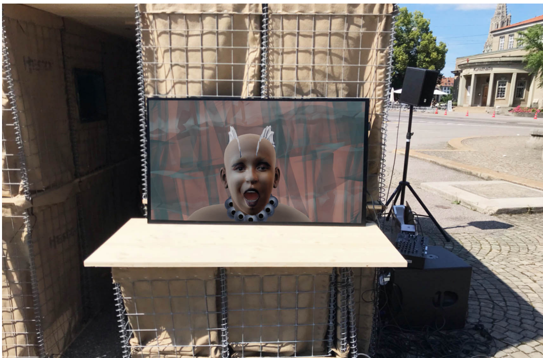
Image 5. Act 2. Gauche Caviar at Mirkan Deniz installation, Bern, 2021 (Motion capture avatar of seven singing Take This Hammer song)

Narrative of Gauche caviar 74 has been told by two motion capture mermaids telling the stories of war-children, fish roe, inherited anxiety, displacement, and sturgeon: the source of caviar, one of the endangered species. This was shown as part of a collective and site-specific performance hosted by the installation of Mirkan Deniz at Helvetia Platz, Bern.